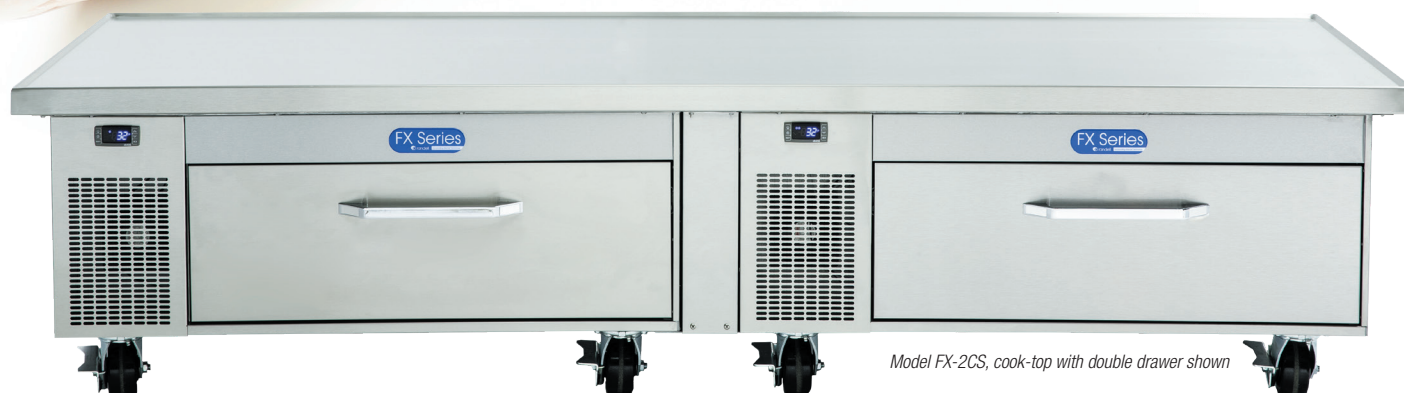
Model FX-2CS, cook-top with double drawer shown