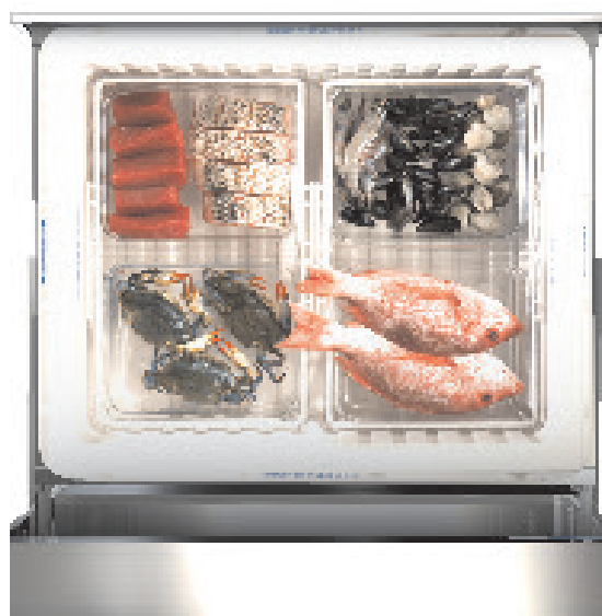
Overhead photo of open drawer with tub

With FX you are not using ice, so your cleanup time is reduced. With the removable tub your steps will be top spray clean and then wipe with sanitizing cleaner and you are ready to refill your tub with product....that simple and easy.