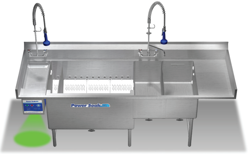
Available on the PS-225 and forthcoming PS-275 Control Systems.