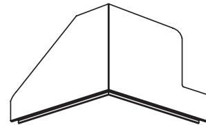
OPTIONAL SPLASH GUARD