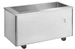
Model IC-3S Open Base shown: