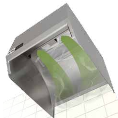
EcoArch Patent-Pending Design

Since its introduction in 2007, the Avtec EcoArch has taken the commercial kitchen ventilation market by storm. And with good reason—the EcoArch is the most energy-efficient, operations-friendly, exhaust-only hood on the market.