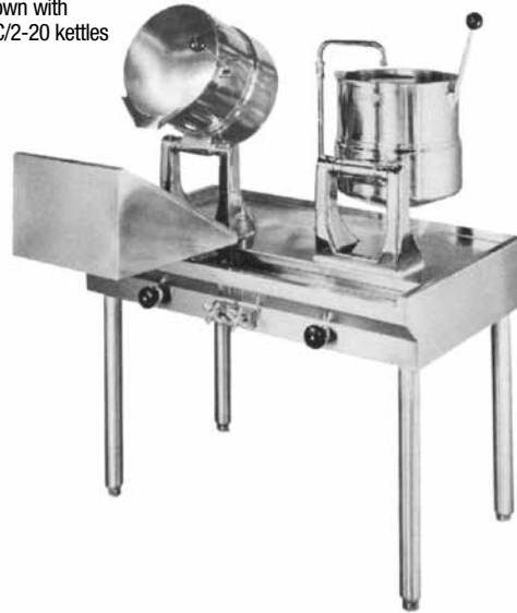
T5C shown with two TDC/2-20 kettles

Equipment table made in the United States.