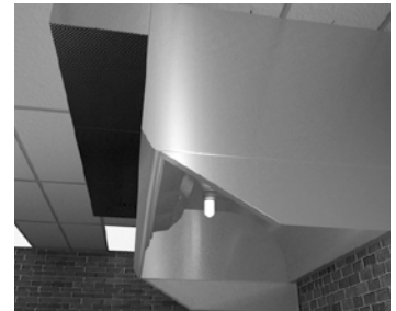
Model EA2-P shown