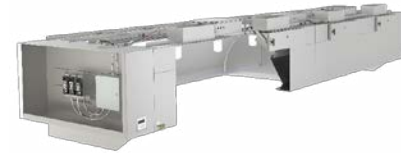
Model EAZ-ST Standard System for Multiple Hoods