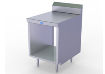
Model 91327 roll warmer shown

SHORT FORM SPEC: Randell 90000 series utility stand with 16 gauge stainless steel top reinforced with two full length channel braces and integral 6.75" coved backsplash with 45° return at top. Unit shipped on standard 6" high adjustable legs mounted to full length channel frame assembly allowing movement of legs to avoid floor obstacles.