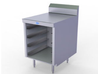
Model 93324 glass rack shown