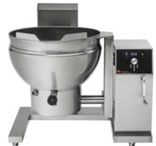
DHS-40A Model shown