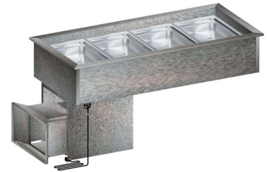
Model RCP-4 shown