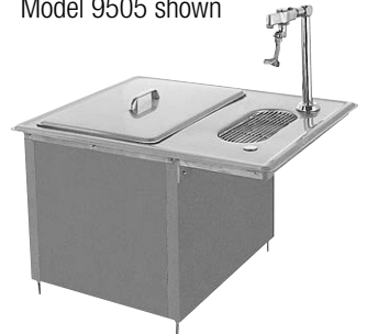
Model 9505 shown

Designed and manufactured in the United States.