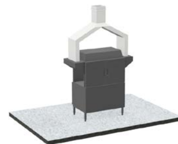
Model SSA-PANTLEG44 shown