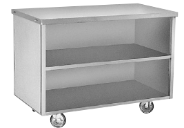
Model RAN ST-4S shown