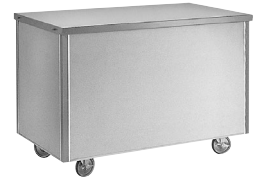
Model RAN ST-4 shown