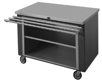
Model RANFG ST-4S shown with RAN TUB48 trayslide