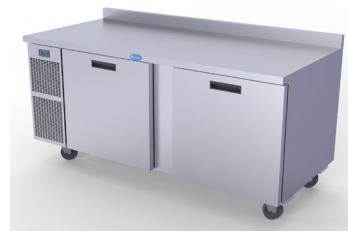
Model 9235-290 shown with Optional Casters